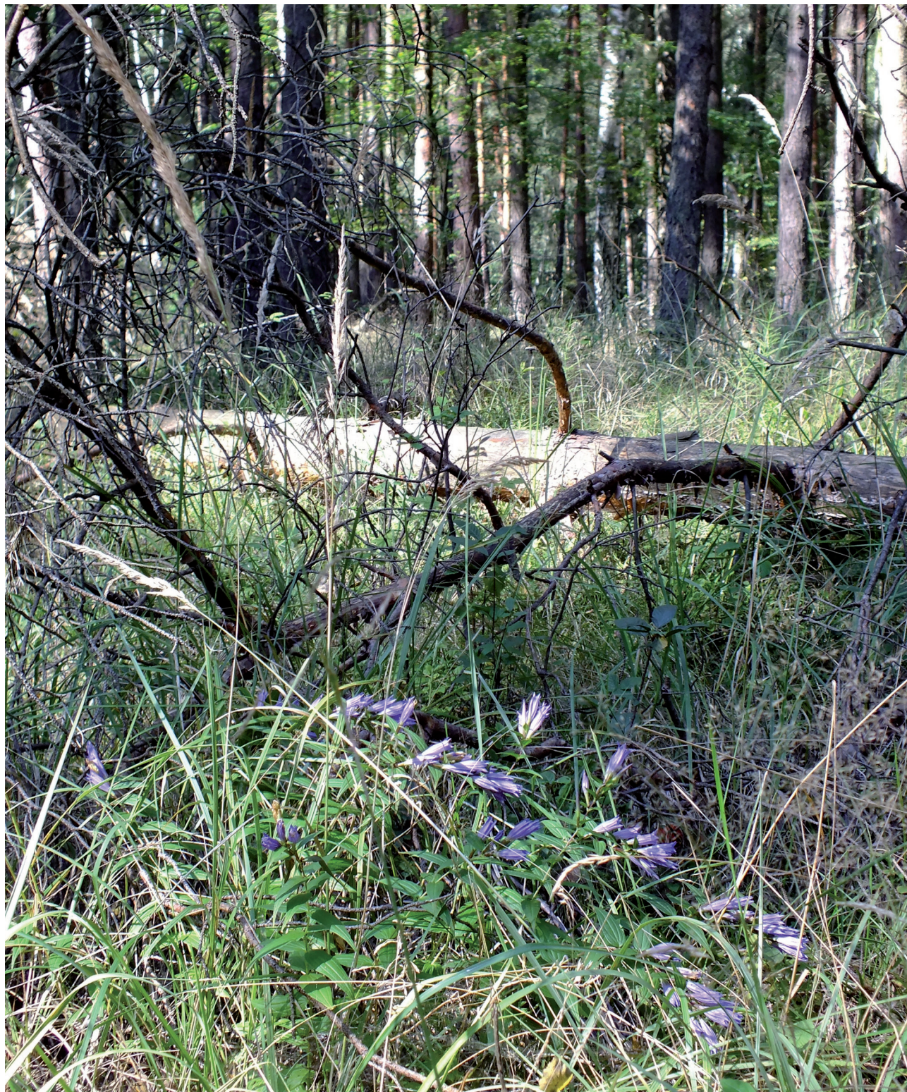
Fig. 2. View of localization of Gentiana asclepiadea L. in Mikołów-Jamna

dium purum 1.2, Sphagnum fimbriatum 1.2, Thuidium tamariscinum 1.2.